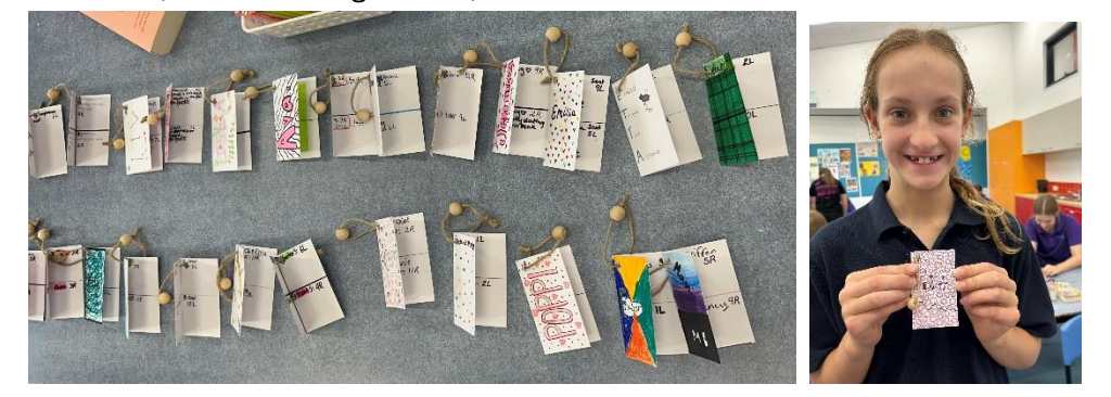
Thank you to Violet, one of our new students, for 'modelling' our appointment cards. Make sure you ask your student about their appointments.

In preparation for our excursion, the students made 'appointment cards' - all students had to 'book' a partner to sit with on the bus for different legs of the trip to and from Altina. The purpose of the activity was to deepen their connection to, and knowledge about, each other.