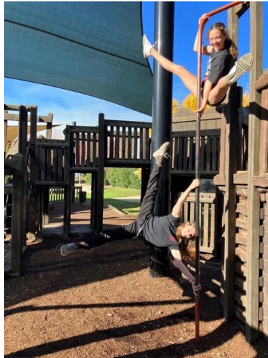
Playing around in Orange!