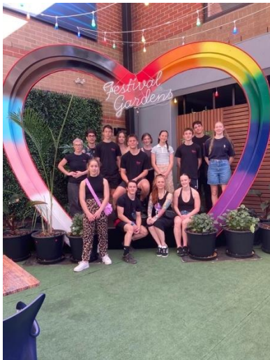
Morning Tea in Parramatta

This week Tempo have left wonderful Wyong for the coastal weather of Port Macquarie. The crew are now over halfway through the tour with only Port Macquarie, Townsville and Alice to go. Here are snaps from the adventures on the road.