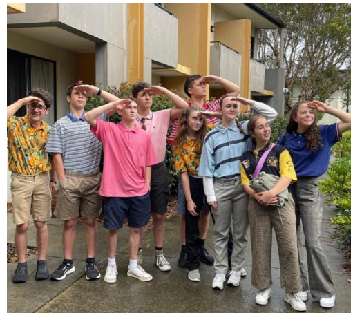
Stepping out in their golfing finest in Wyong. Sadly no golf was actually played due to a complete rain out.